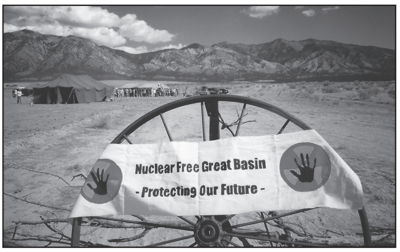
Skull Valley, Utah, 2002

mittee's ongoing discussion and to attend the Committee's next meeting.