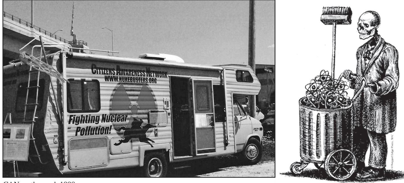
CAN on the road, 1998